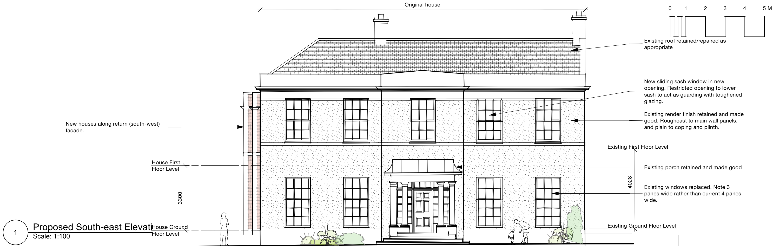
1 Proposed South-east Elevation Scale: 1:100